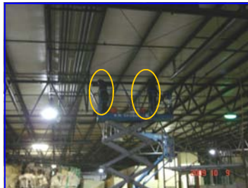
Employees in lift cleaning ceiling