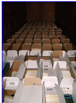
Semi Load of deodorized documents