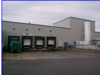
Exterior of Flexible Foam Building

water from the loading dock and chemical storage room, put protection tarps over equipment, washed the walls, ceiling beams and floors. FGS The Restoration Company also had to replace some carpet and tiles in the office area. In addition, we dried, deodorized and repacked a semi load of important documents. In conclusion, we had staff members there in two different shifts ensuring that we would be done on time. The plant was able to reopen within the allowed 4 weeks.